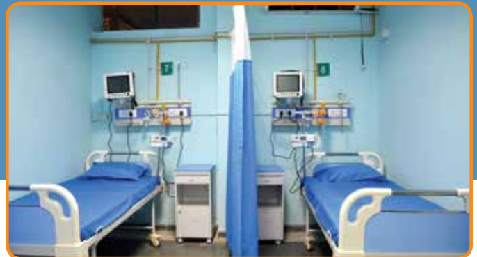
Semi Private Room